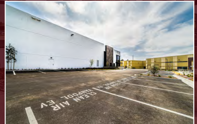
Designated Clean Air Vanpool EV Parking Spaces