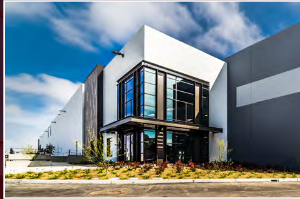
Wood-Finish Tile Panels with Black Steel-Enclosed Glass Line Entrance