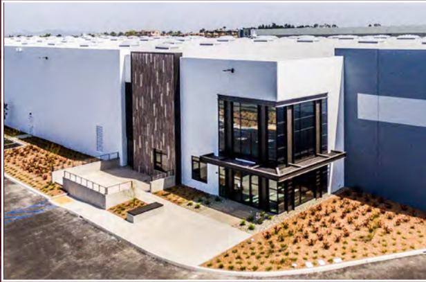
Contemporary Exterior Patio Area