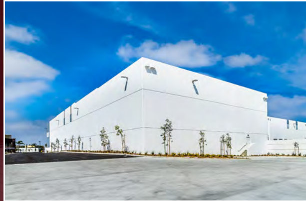
Shared Drive Around Access with Secured Gated Entry