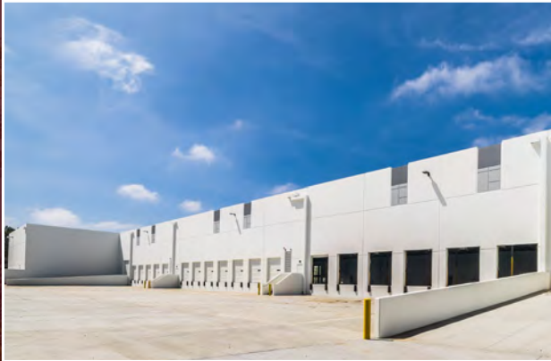
9 Dock High Doors 1 Grade Level Door